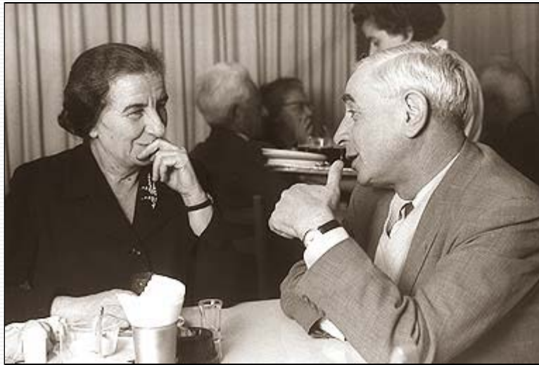
hatching state sponsored terrorism in the region: Golda Meir, Pinhas Lavon